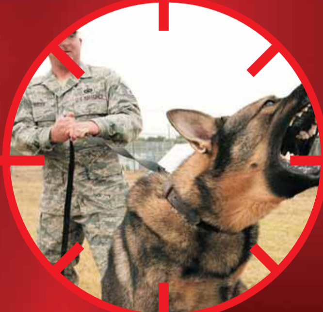
MILITARY DOG UNITS